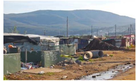
Living Conditions in Zwelihle